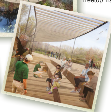
Animal Encounters programming