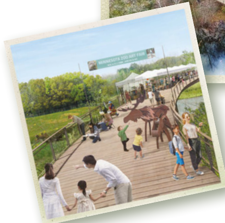
Arts and culture programming